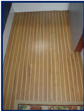
Teak and Holly Flooring