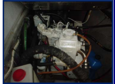
Next Generation 3.5 KW