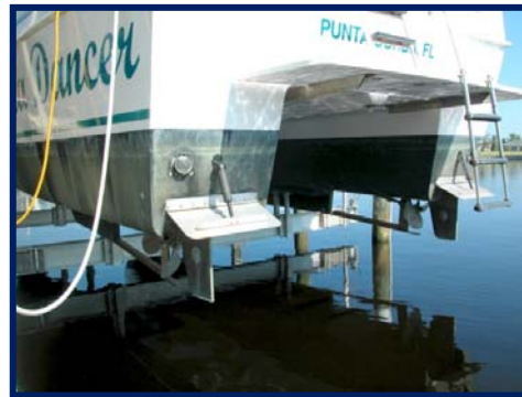
Sistership Photo - Running Gear